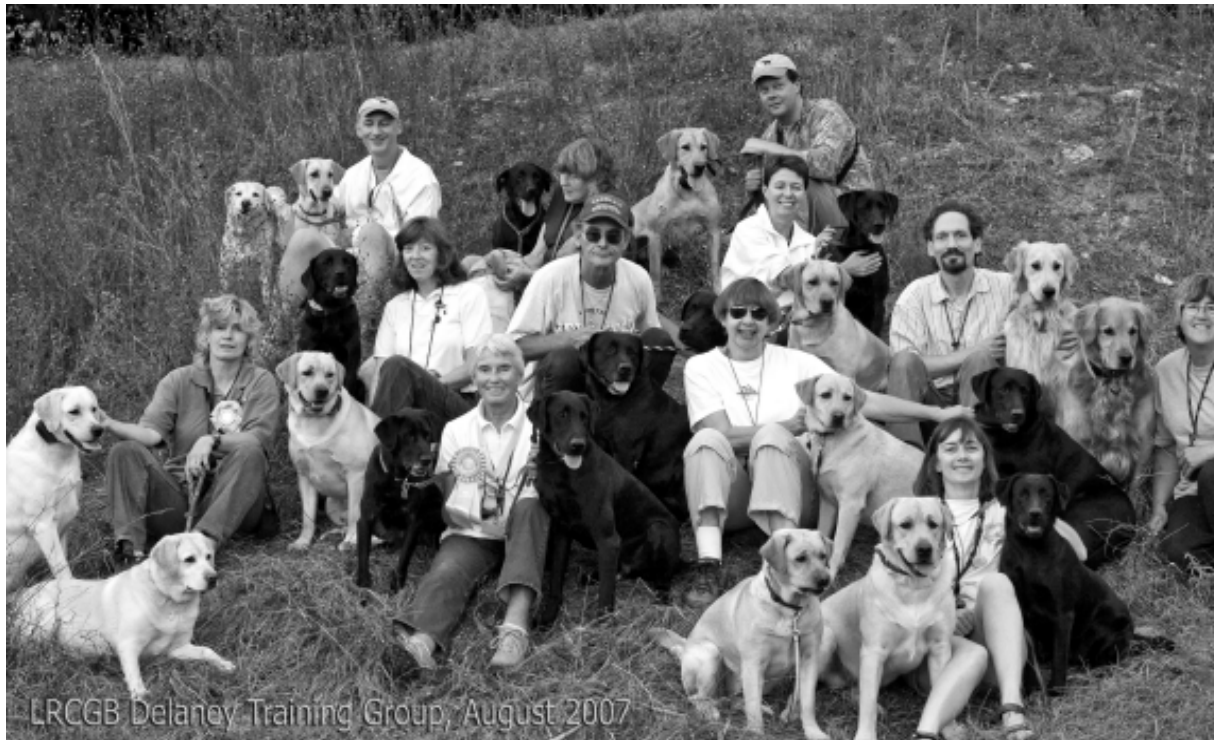
The Delaney Tuesday Night Regulars (LRCGB field training group) have had a wonderful hunt test season. Altogether this group has earned 12 WCs, 4 WCIs, 3 WCXs, 9 Junior Hunter titles, 2 Senior Hunter titles, 4 Master Hunter titles, 2 Master National Qualifications, 11 JH legs, and 6 MH legs.