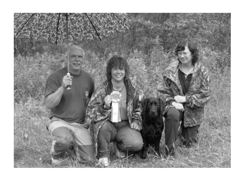
In June we headed to New York to complete our Junior Hunter Title!!!

Then we headed to the Working Certificate in July were we earned our WCI and placed 2<sup>nd</sup> in the Triple Crown!!