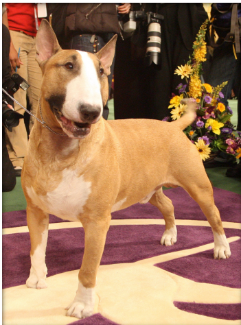
Colored Bull Terrier

Canine Ambassador "Billy D" visits schools to teach children how to be safe around dogs.