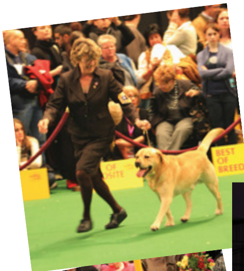
Westminster Kennel Club Show 2010

Got Brags? email them to Robin to be included in future publications. grampianlabs@comcast.net Want them on the web? Email Rainer Fuchs: rainer@fuchsamerica.com