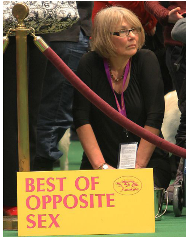
Westminster Kennel Club Best of Opposite Sex