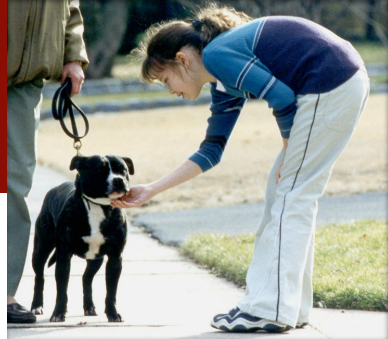
Staffordshire Bull Terrier

AKC® believes a dog should be judged by its deeds, not its breed. We are dedicated to the passage of reasonable, enforceable, non-discriminatory laws to govern the ownership of dogs.