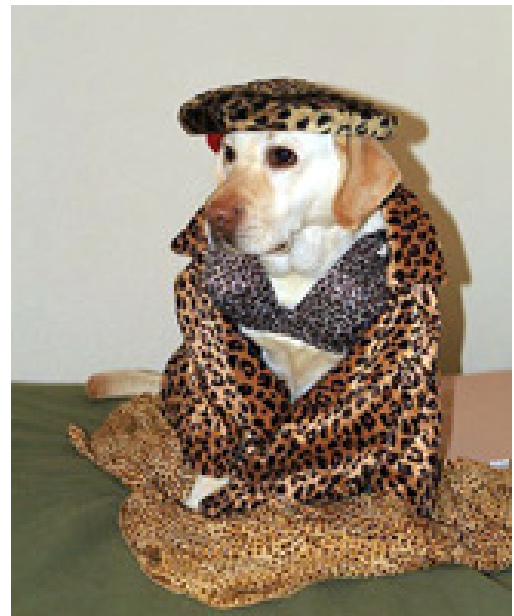
What they were wearing to the dog show in NYC.