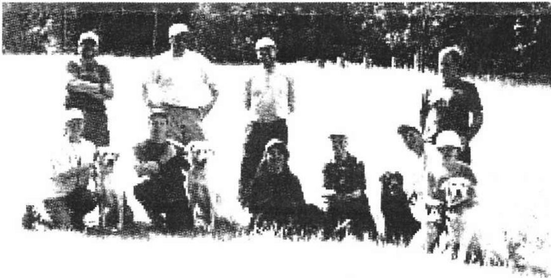
"Graduating Class" from the LRCGB's Spring's beginning field training class.