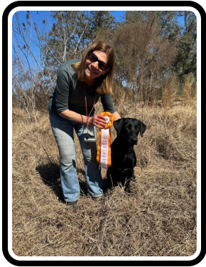
Jazzy's debut into Senior! Paisley, Florida